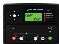
DSE8711 Standard Remote Display Module