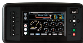
DSE8721 Colour Remote Display Module