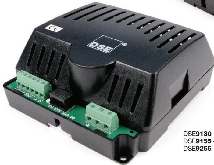
DSE9150 - 3 A 12 V

DSE9130 - 5 A 12 V DSE9155 - 2 A 30 V DSE9255 - 5 A 24 V